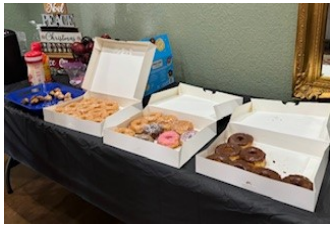
We had an awesome group of wagonmasters making everything run like a well oiled machine. You guys rock!

Saturday morning was donuts and coffee followed by the business meeting.