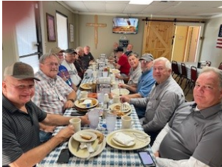
Friday morning the guys went to Rio Rancho Café for the ROMEO breakfast.