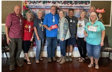
New officers were elected for 2025. Thank you all for helping keep the South Texas Renegades going. We appreciate you.

Saturday night was catered by Mamacita's Mexican Food. We enjoyed a great meal of fajitas and all the fixins.